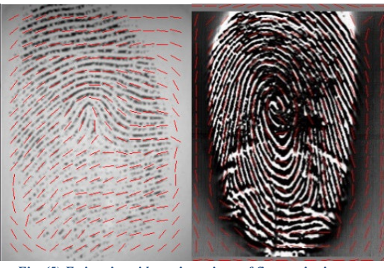
Fig. (5) Estimating ridge orientations of fingerprint images.

interrupted ridges. As shown in Fig. (5), ridge orientations are estimated by directional derivative.