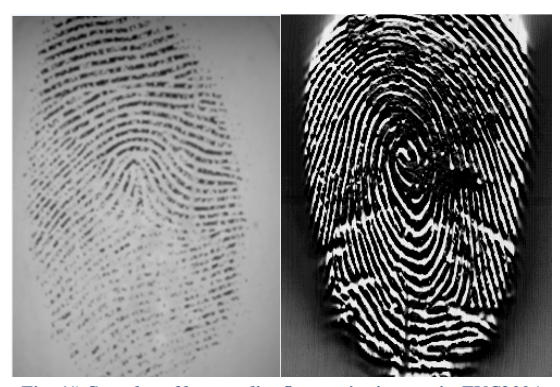
Fig. (4) Samples of low-quality fingerprint images in FVC2004.

Low-quality fingerprint images are used as input are illustrated in Fig 4.