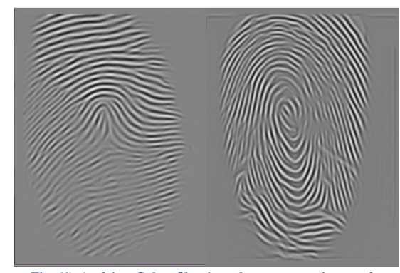
Fig. (6) Applying Gabor filter in order to prepare images for reconstruction

Because Gabor filter extracts all minutiae of ridges or valleys from various angles, it is exploited for detaching fingerprints from their backgrounds. Results of Gabor filter application are shown in Fig. (6).